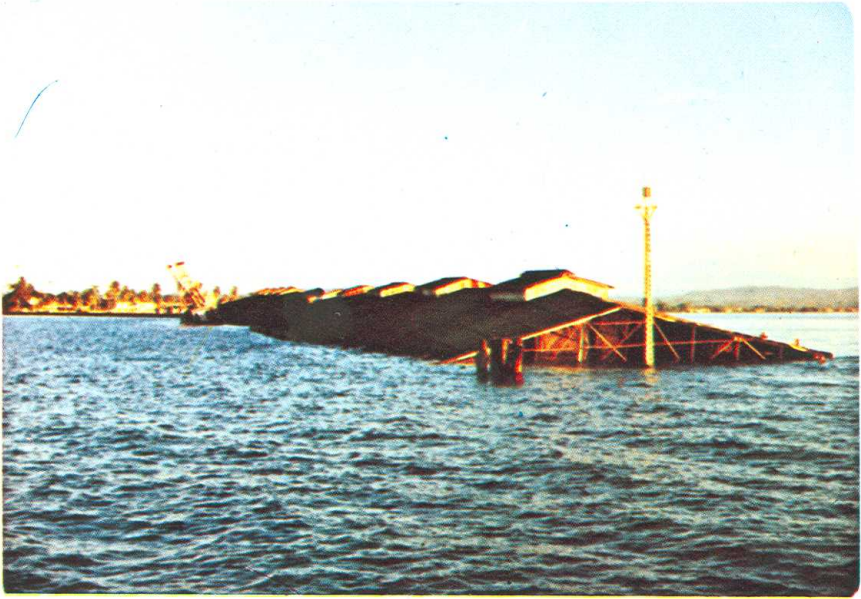
Sunken pier at Puerto Barrios