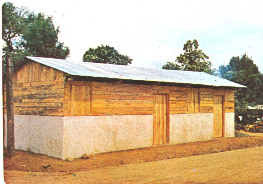
Reconstructed home, Zaragosa.