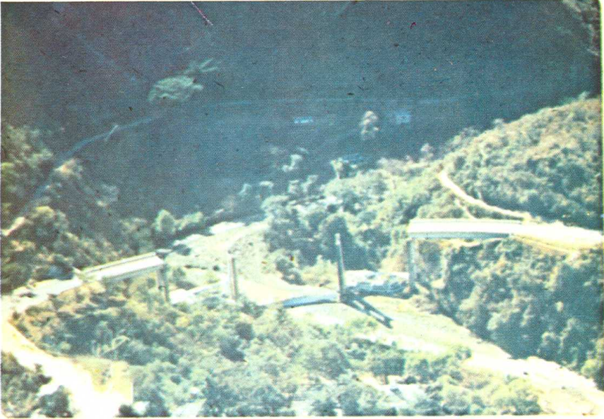
Collapsed bridge at Aguas Calientes, on route to main port in Caribbean.