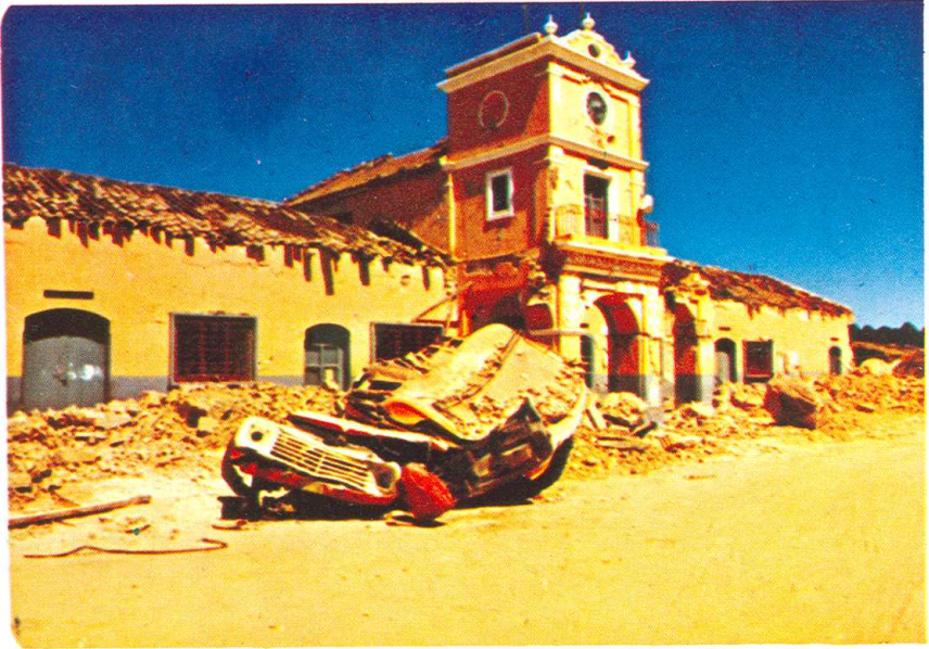
San Juan Sacatepéquez