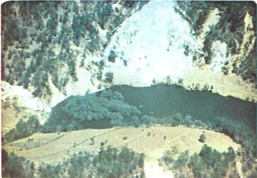
Artificial lake caused by landslides following earthquake