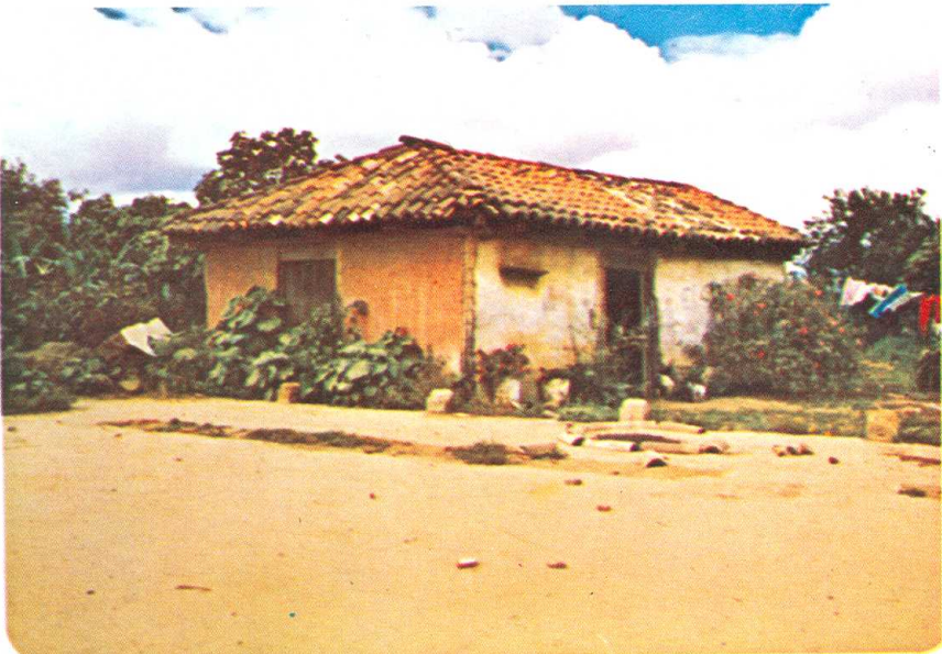
House reinforced by wooden posts and barbed wire withstood earthquake. Zaragosa