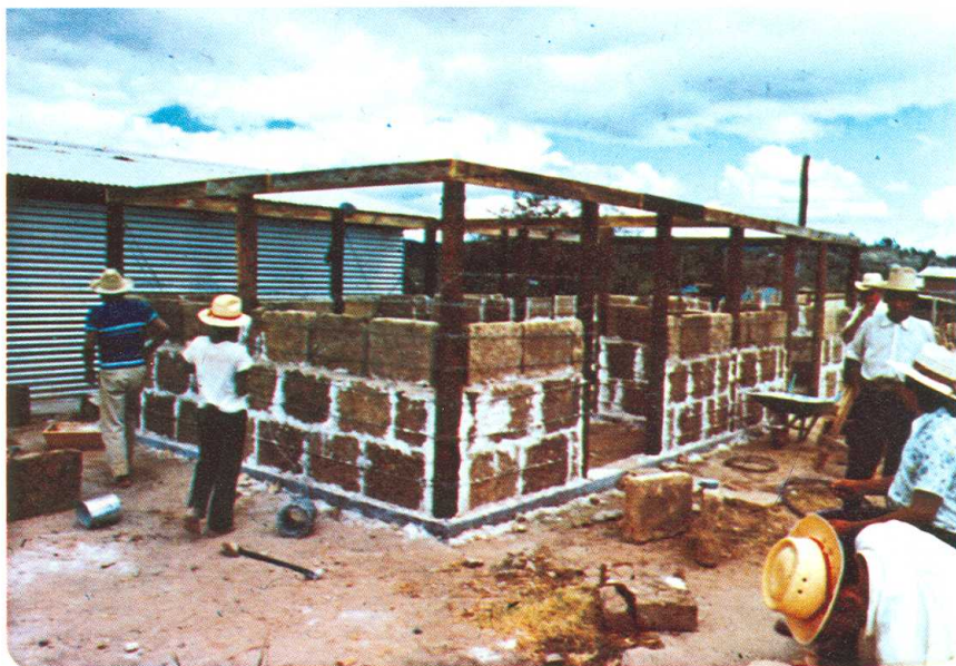
Earthquake resistant housing promoted by voluntary agency. San Martín Jilotepeque.