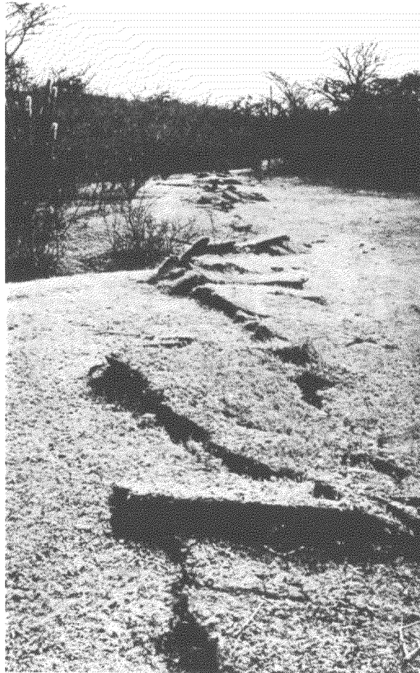
Figure 5. Oppositely directed overthrust slabs of soil along en echelon fissures.