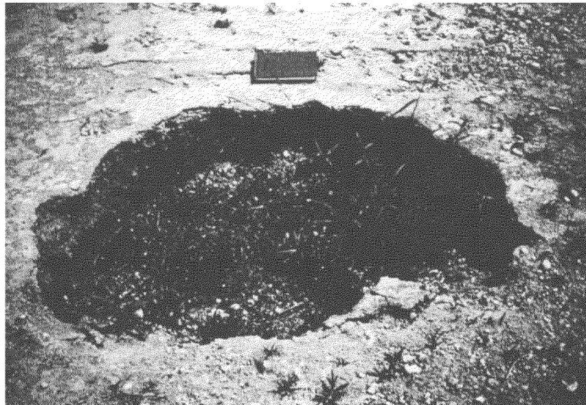
Figure 2. Flat bottomed, steep sided sand boil which does not have a cone of deposited sand associated with it, located near the mouth of the Villalobos River at La Playa, Guatemala.