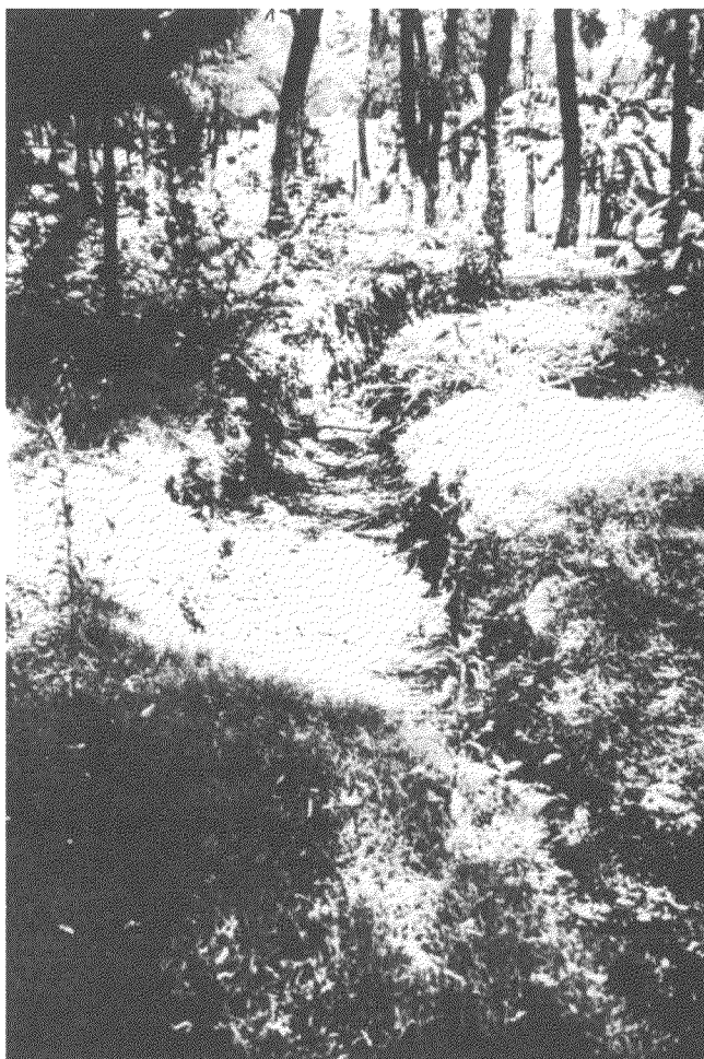
Figure 7. Typical ground crack due to lateral spreading at La Playa, illustrating vertical sides and flat sandy bottoms.