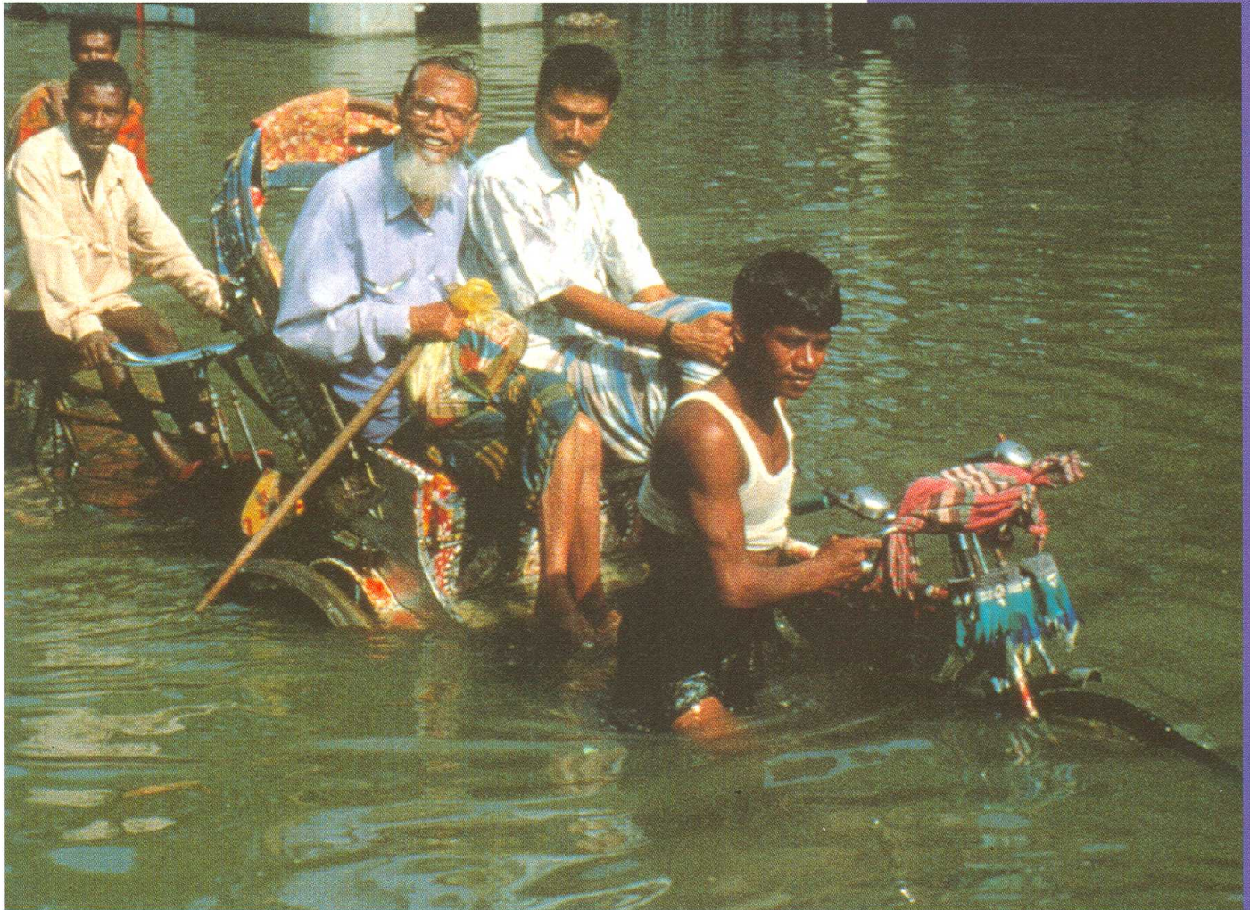
Flooded Street, Bangladesh Naogaon City.

The graphs in figure B show that Asia is the continent that suffers the most from floods. Data from the emdat Database of the Centre for Research in the Epidemiology of Disasters (CRED) in Brussels show that it suffered 44 per cent