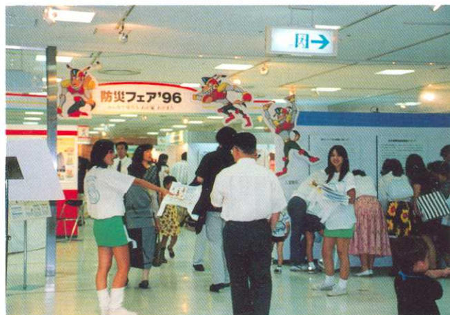
防災フェア Disaster Prevention Fair

Then, by designating September 1st as “Disaster Prevention Day” and the period from August 30th to September 5th as “Disaster Prevention Week”, disaster prevention fairs and lectures are held, while various events such as a contest for disaster prevention posters are carried out in and about this week.