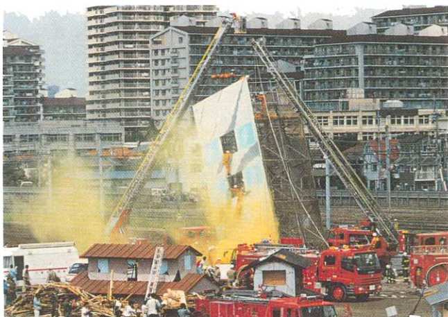
総合防災訓練（平成8年9月1日、川崎市） Comprehensive exercise for disaster prevention ('96.9.1 Kawasaki City)

Especially on the “Disaster Prevention Day” of September 1st, the Government, the designated disaster prevention organs concerned, the local public bodies and other organizations jointly stage a practical wide area and large scale “comprehensive exercise for disaster prevention” every year.