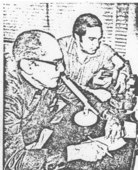
On the scene in Guatemala — TG9MP (left) and WA4ZZG operating the specially-designated station TG9SIRA.