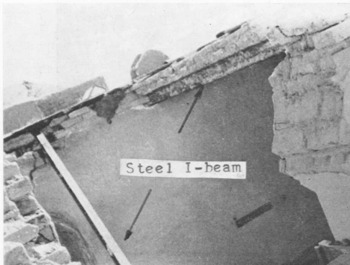
Collapse of roof of dispensary of Buin-Zahra (Buin-Zahra Earthquake of September, 1st, 1962 — Iran).