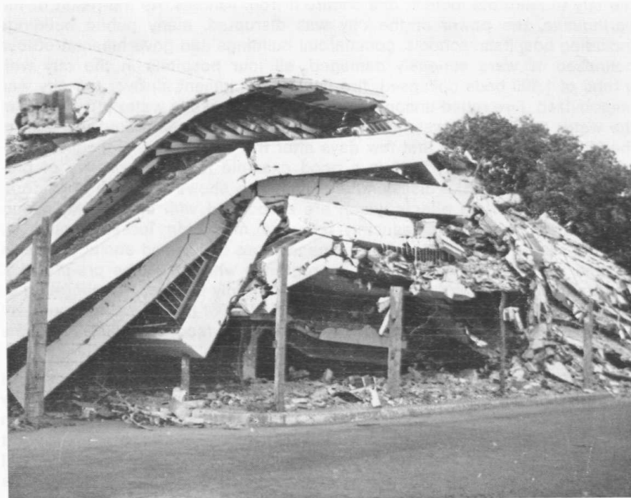
Collapse of six stores reinforced concrete social security building in Managua earthquake of December 23, 1972.