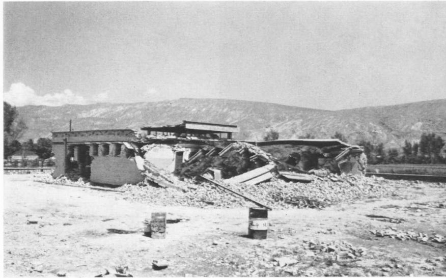
Collapse of medical center in Ghir (Iran) earthquake of April, 10, 1972.