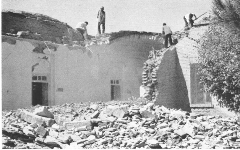
Collapse of typical building in earthquake of August 31, 1968 in Dashte-Bayaz earthquake.