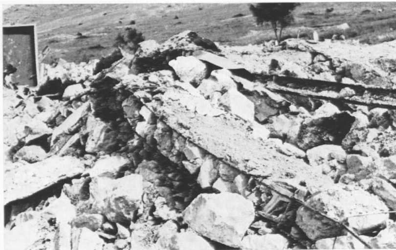
Behaviour of traditional buildings in earthquake of April, 10, 1972 in Ghir (Iran).