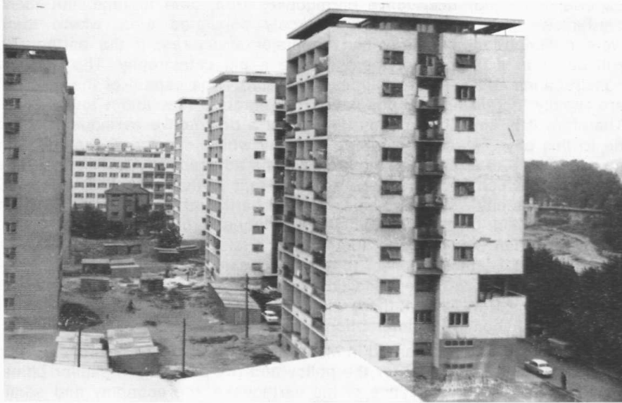
Damages to high rise building in Skopje (Yugoslavia) earthquake of July 26, 1973.