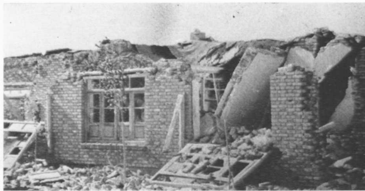
Collapse of dispensary due to earthquake of September, 1st, 1962 in Buin-Zahra (Iran).